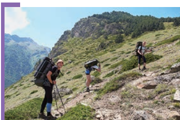
• Outdoor activities