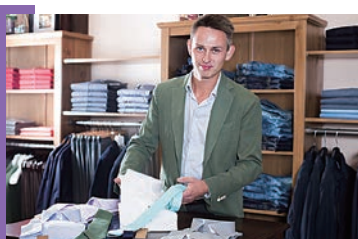
• Small business