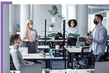
• Social Distancing